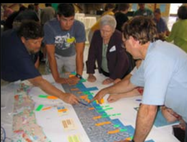
Public participation in planning